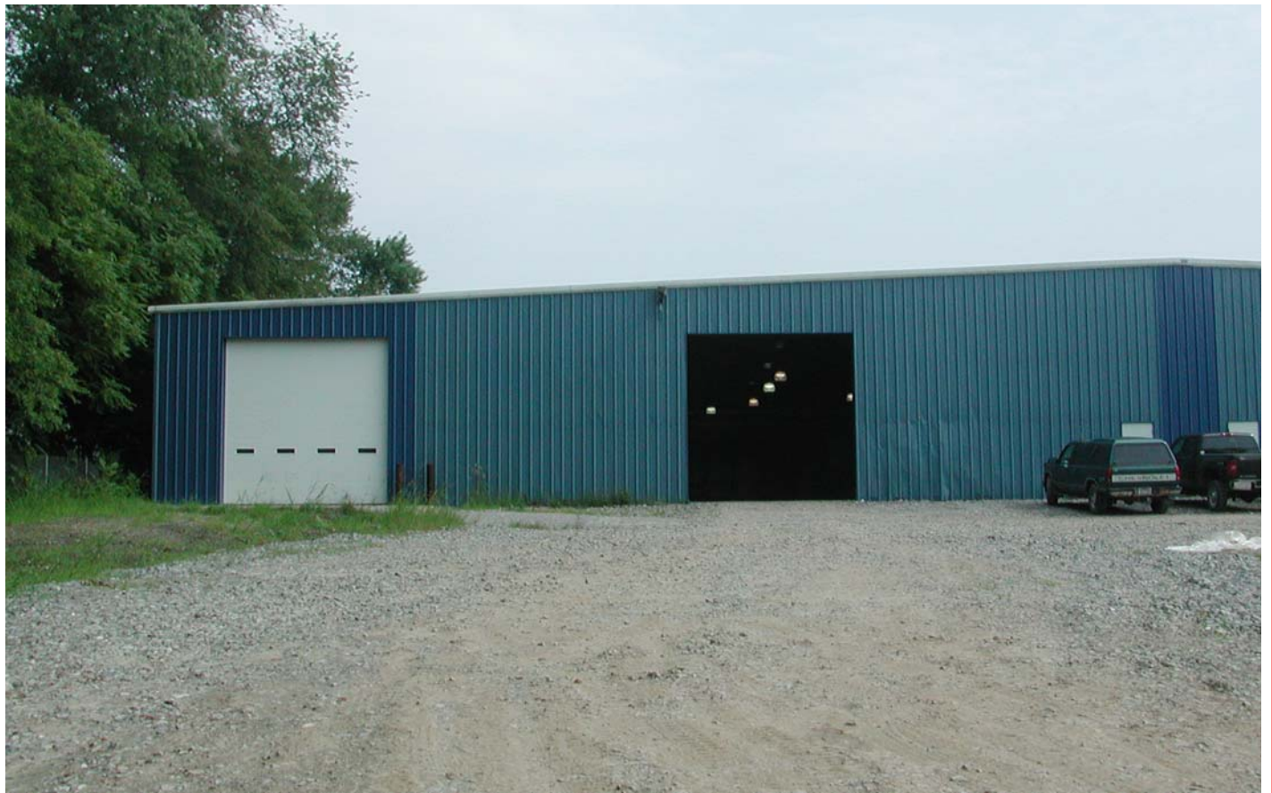
AVAILABLE SECTION (23,495 SQ. FT.)