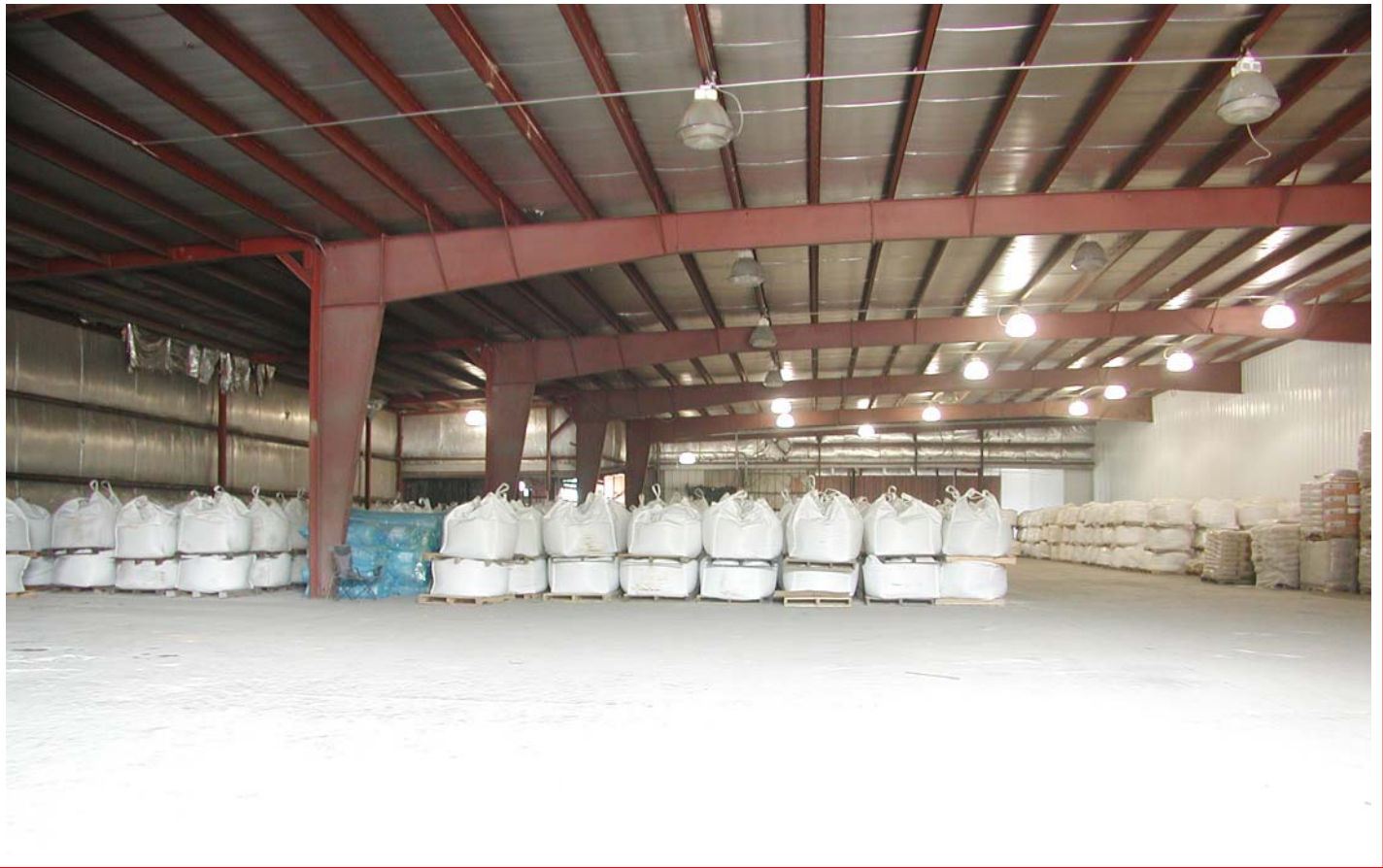
AVAILABLE MANUFACTURING/WAREHOUSE SPACE (17,820 SQ. FT.)