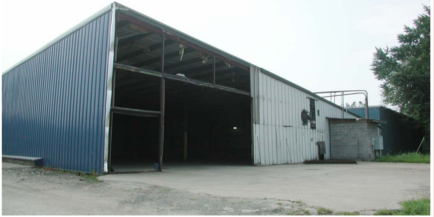
AVAILABLE SECTION (23,495 SQ. FT.)