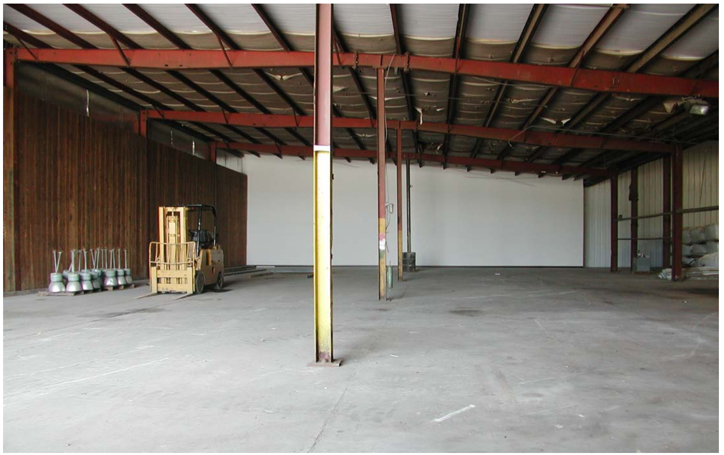
AVAILABLE MANUFACTURING/WAREHOUSE SPACE (5,675 SQ. FT.)