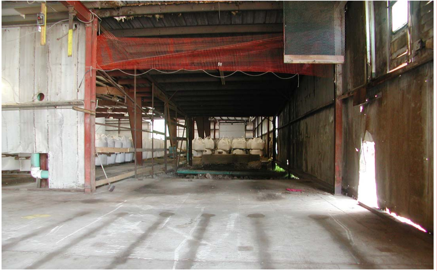
POSSIBLE OFFICE SPACE BUILD-OUT LOCATION