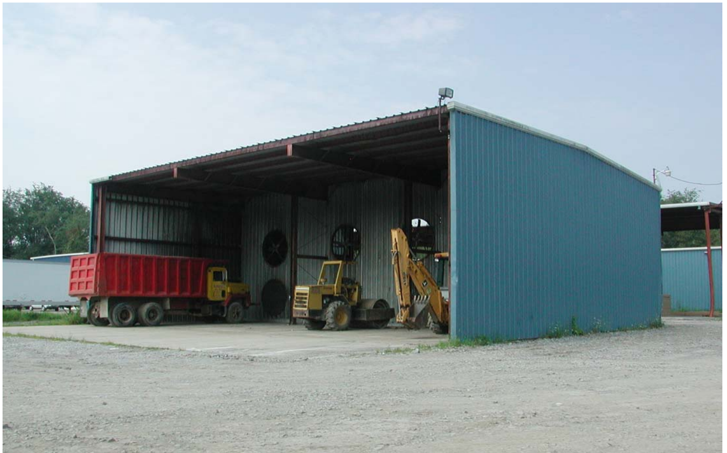
3,960 SQ. FT. STORAGE SHED AVAILABLE (60' X 66' WITH 20' CEILING HEIGHT)